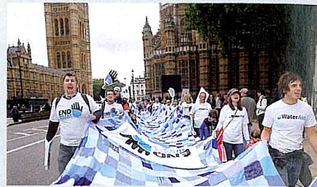
'Knitition': the giant scarf is taken through Westminster

WaterAid delivered a knitted petition to Downing Street as part of the charity's End Water Poverty campaign.